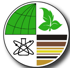
Institute of Physicochemical and Biological Problems in Soil Science