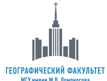
Geography faculty of Lomonosov Moscow State University