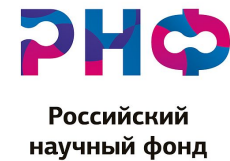
Russian Science Foundation