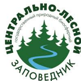
Central Forest Biosphere Reserve